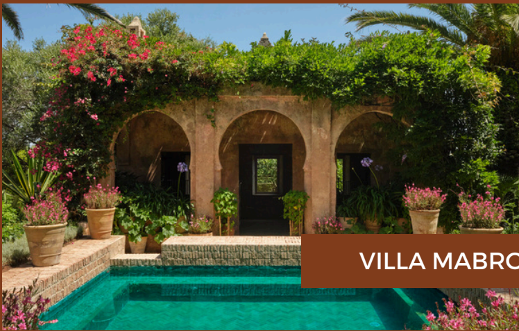
VILLA MABROUKA, TANGIER

Yves Saint Laurent's former villa exudes artistic sophistication. Intimate boutique property with lush gardens, Moroccan-French design, and exclusive hillside location overlooking the sea.