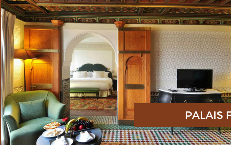
PALAIS FARAJ, FES

Restored 19th-century palace overlooking Fes medina. Rooftop infinity pool, spa sanctuary, and palatial suites offer refuge after navigating the ancient city's maze.