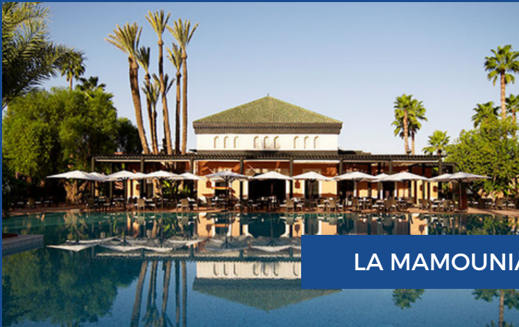
LA MAMOUNIA, MARRAKECH

A legendary art deco palace where Churchill painted and Hitchcock honeymooned. Lush gardens, Michelin-starred dining, and opulent suites define Marrakech's most iconic hotel.