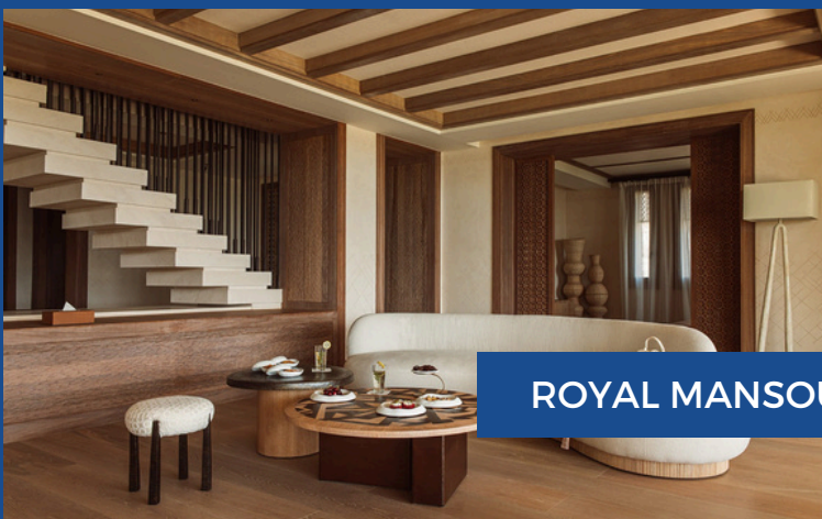
ROYAL MANSOUR, MARRAKECH

Each guest enjoys a private riad within this palatial property. King-commissioned craftsmanship, underground passages, rooftop terraces means unparalleled exclusivity and Moroccan artistry.