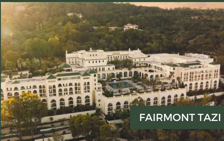
FAIRMONT TAZI PALACE, TANGIER

Each guest enjoys a private riad within this palatial property. King-commissioned craftsmanship, underground passages, rooftop terraces means unparalleled exclusivity and Moroccan artistry.