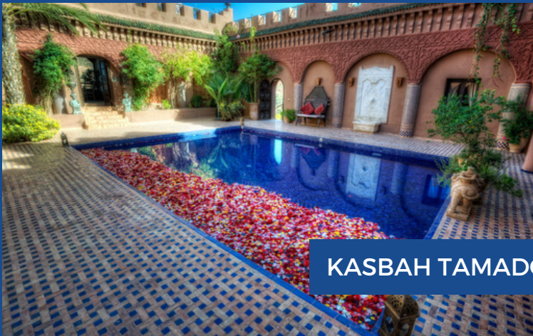
KASBAH TAMADOT, ATLAS REGION

Richard Branson's mountain sanctuary offers infinity pools with Atlas views, antique-filled suites, and Berber hospitality. Adventure basecamp meets five-star retreat in stunning terrain.