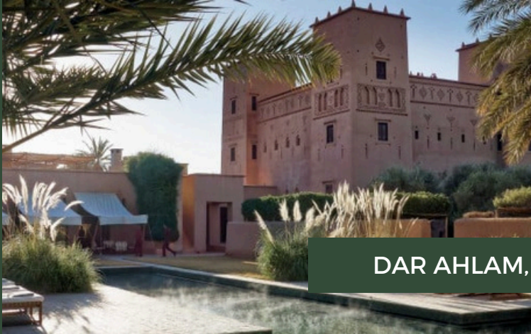
DAR AHLAM, OUARZAZATE

Exclusive kasbah known for curated and personalized experiences. Desert luxury redefined with pool, hammam, gourmet cuisine, and only fourteen guests maximum.