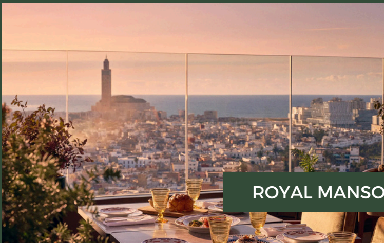
ROYAL MANSOUR, CASABLANCA

Each guest enjoys a private riad within this palatial property. King-commissioned craftsmanship, underground passages, rooftop terraces means unparalleled exclusivity and Moroccan artistry.