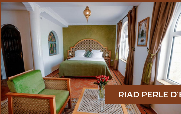
RIAD PERLE D'EAU, ESSAOUIRA

Seaside riad blending coastal charm with refined comfort. Rooftop terrace captures ocean breezes and medina views. The perfect intimate escape in Morocco's bohemian surf town.