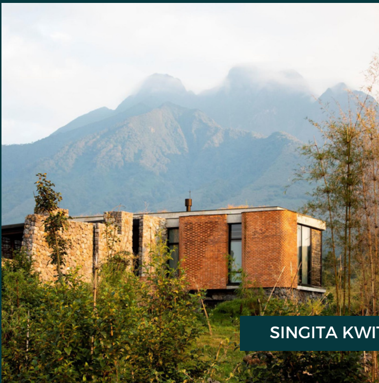
SINGITA KWITONDA LODGE