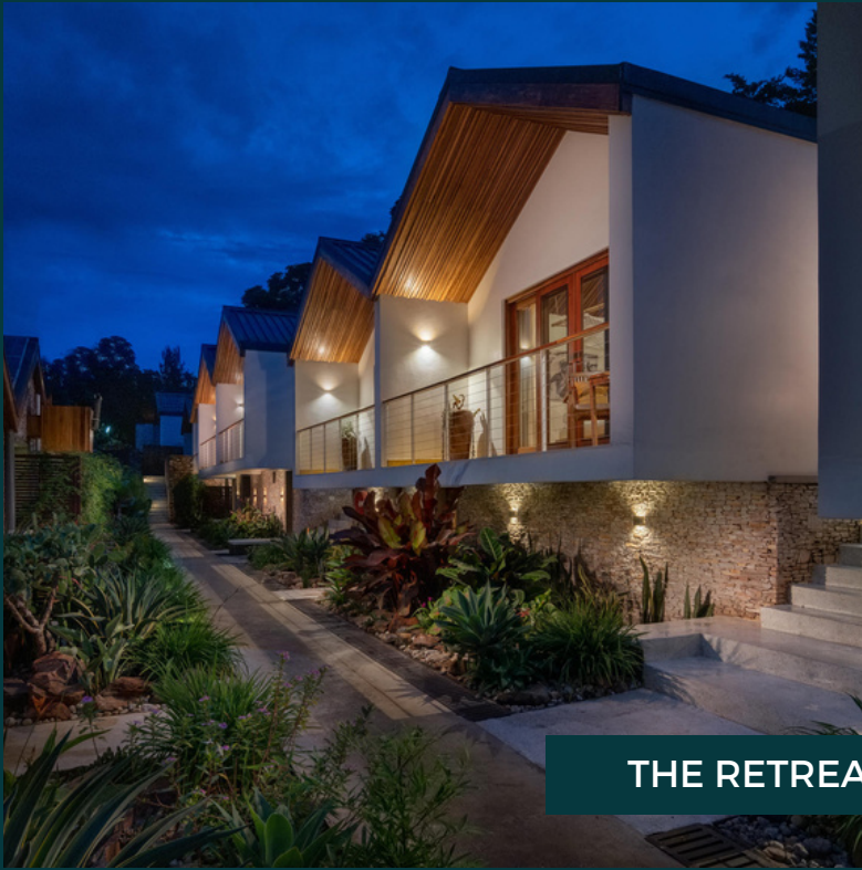
THE RETREAT BY HEAVEN