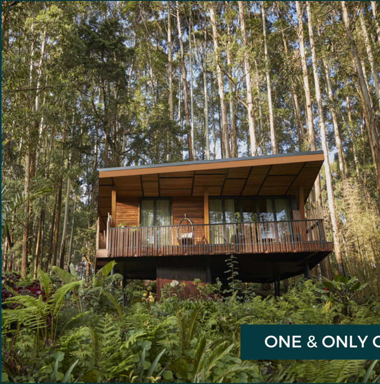
ONE & ONLY GORILLA'S NEST