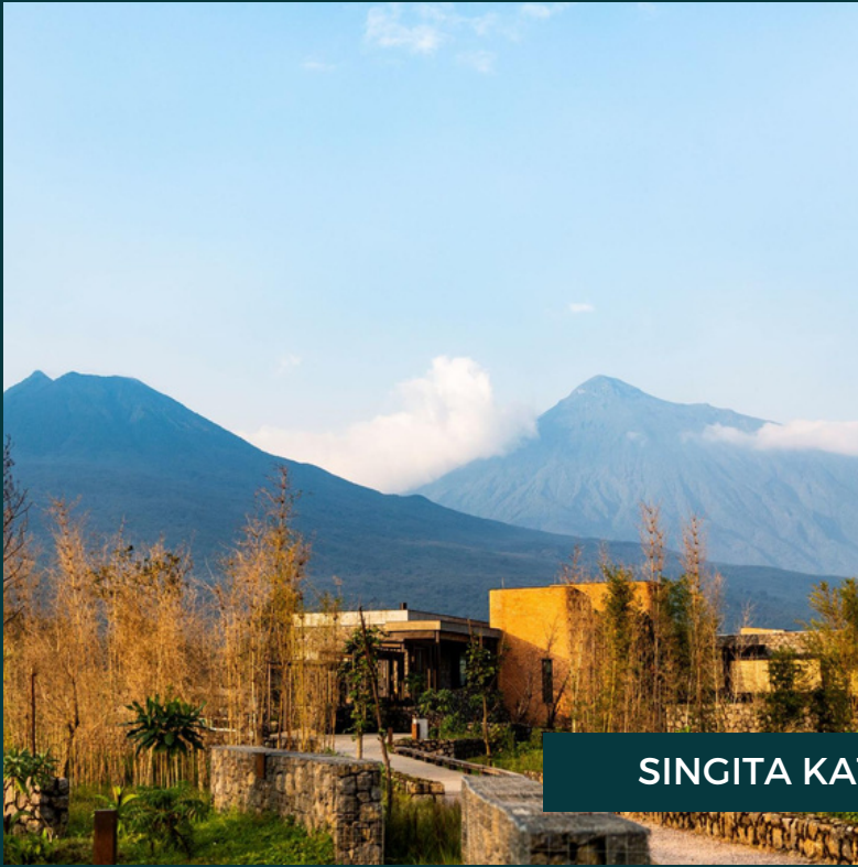
SINGITA KATAZA HOUSE