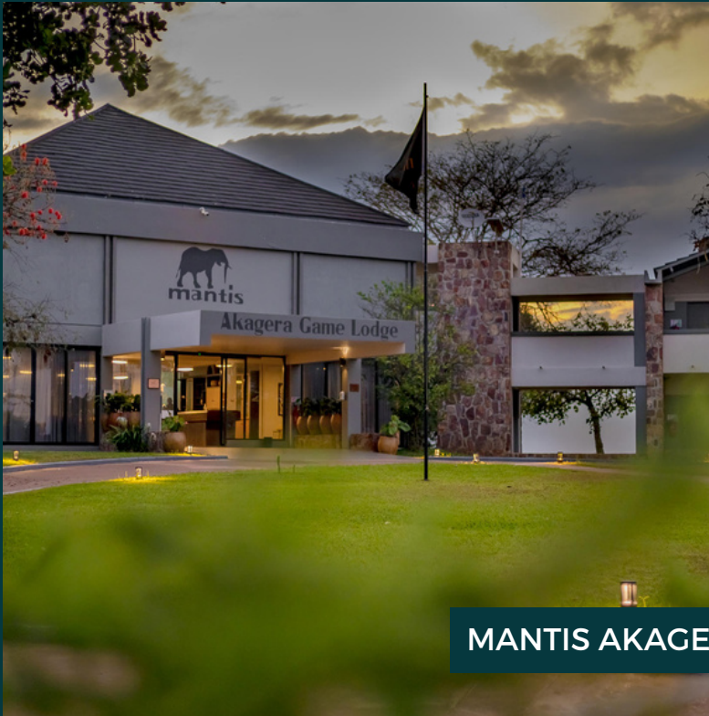
MANTIS AKAGERA GAME LODGE