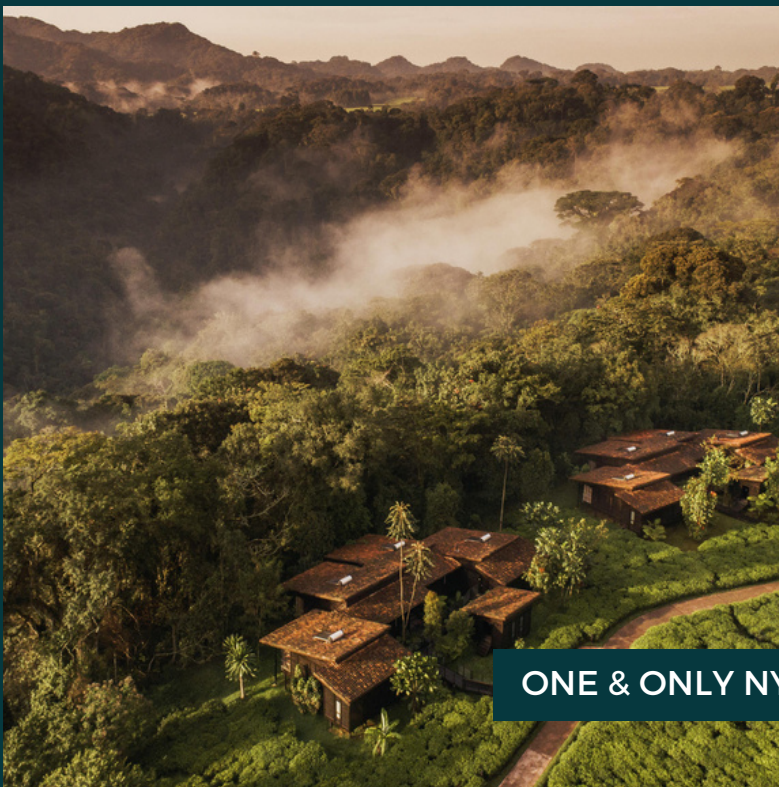
ONE & ONLY NYUNGWE HOUSE