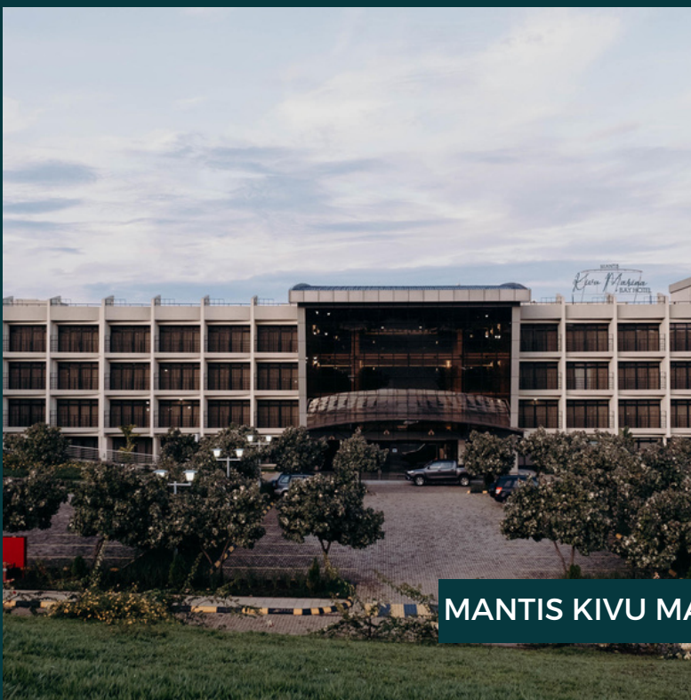
MANTIS KIVU MARINA BAY HOTEL