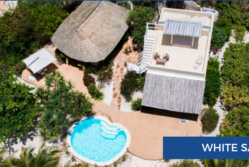
WHITE SAND VILLAS