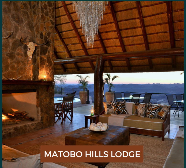
MATOBO HILLS LODGE