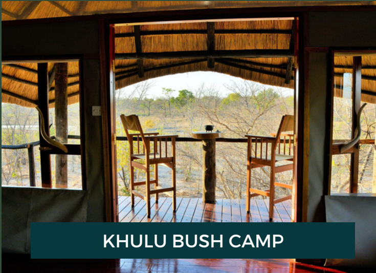
KHULU BUSH CAMP