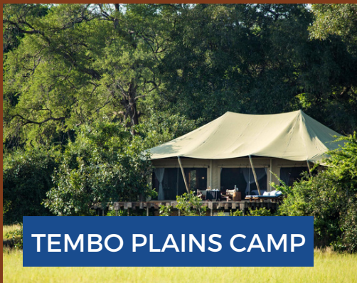
TEMBO PLAINS CAMP