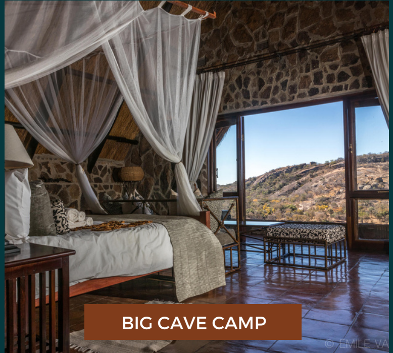
BIG CAVE CAMP