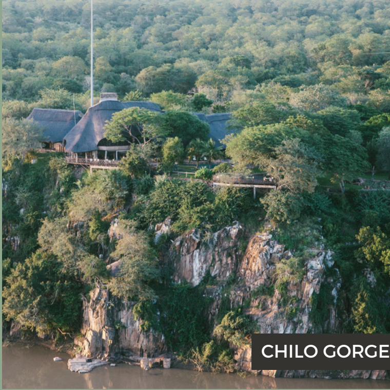
CHILO GORGE SAFARI LODGE