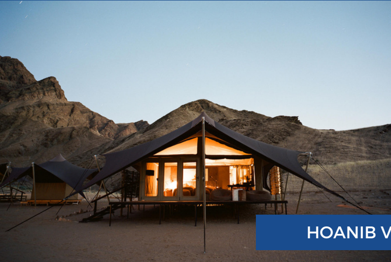
HOANIB VALLEY CAMP