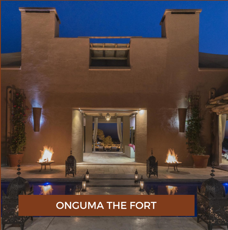
ONGUMA THE FORT