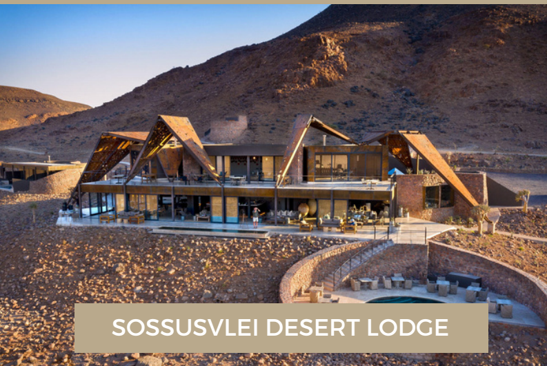
SOSSUSVLEI DESERT LODGE