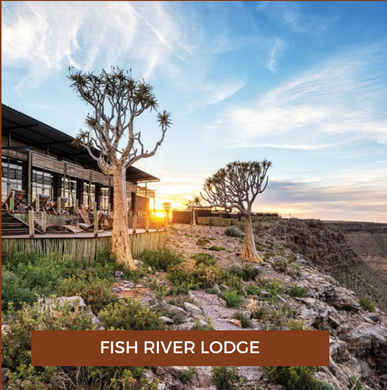
FISH RIVER LODGE