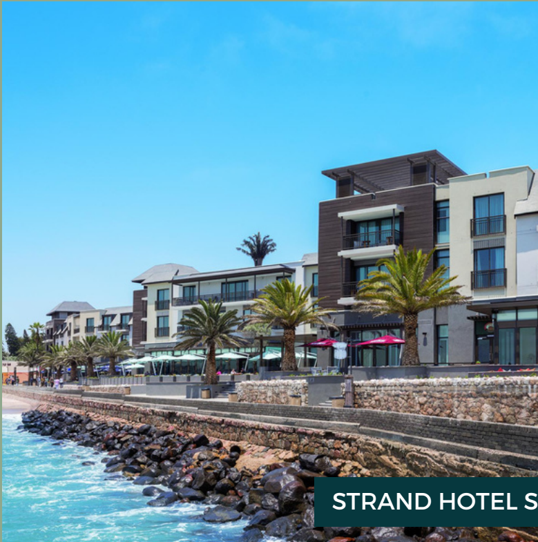
STRAND HOTEL SWAKOPMUND