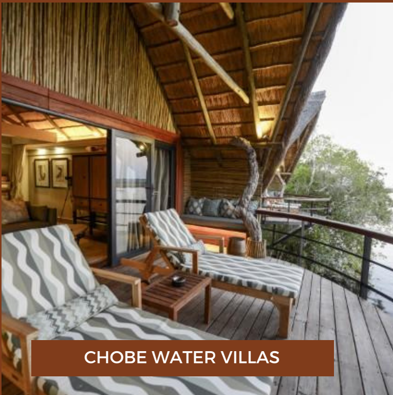
CHOBÉ WATER VILLAS