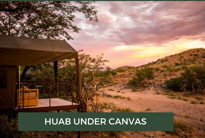
HUAB UNDER CANVAS