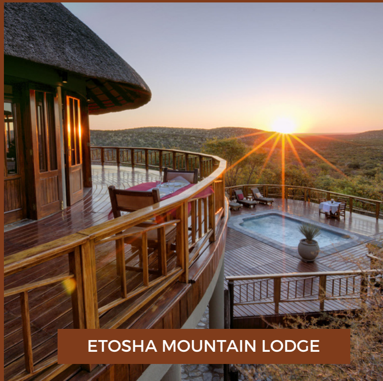
ETOSHA MOUNTAIN LODGE