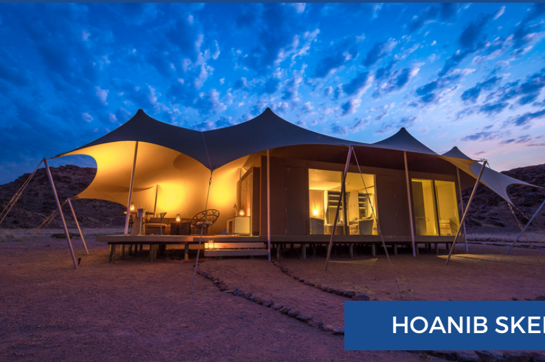
HOANIB SKELETON COAST