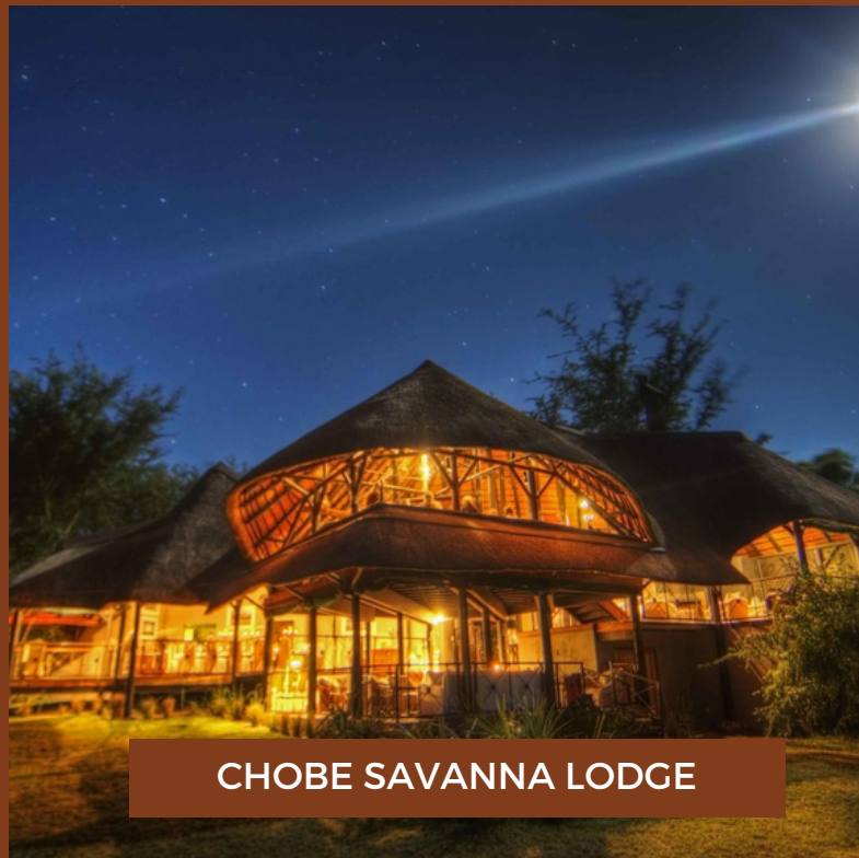
CHOBÉ SAVANNA LODGE