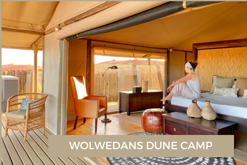
WOLWEDANS DUNE CAMP