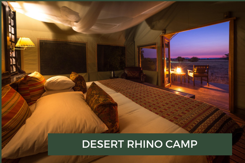
DESERT RHINO CAMP