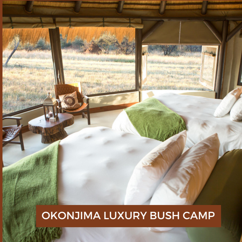
OKONJIMA LUXURY BUSH CAMP